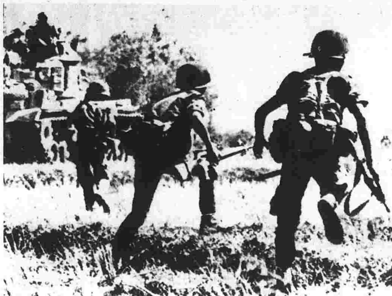
South Viet soldiers run beside a U.S. tank as they charge positions of a North Vietnamese unit along the coast, 25 miles from the DMZ.