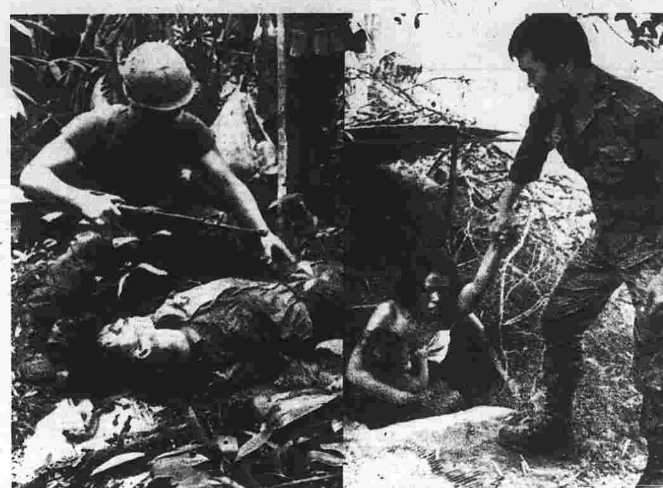
GI checks pockets of dead North Vietnamese for identification minutes after the enemy soldier was killed in an ambush set by GIs in jungles near the Cambodian border.

ABOARD THE USS HARTLEY (AP) — Water poured into the hold of the dilapidated Liberty ship Leif Eriksson.