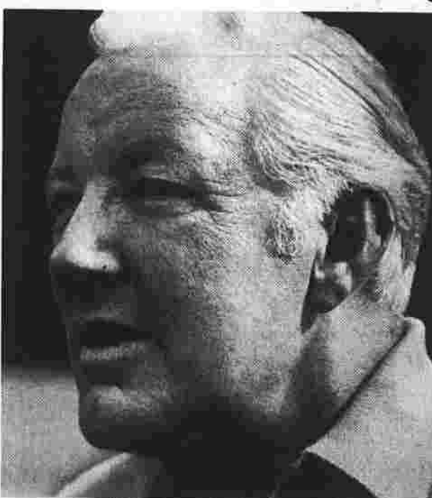
DONAHUE. THE DEMOCRAT. SOMEONE'S BEGINNING TO MAKE SENSE.

DEMOCRATIC PRIMARY. 12 NOON TO 8 P.M. WEDNESDAY, AUGUST 19. PULL DOWN AND LEAVE DOWN LEVER 1A.