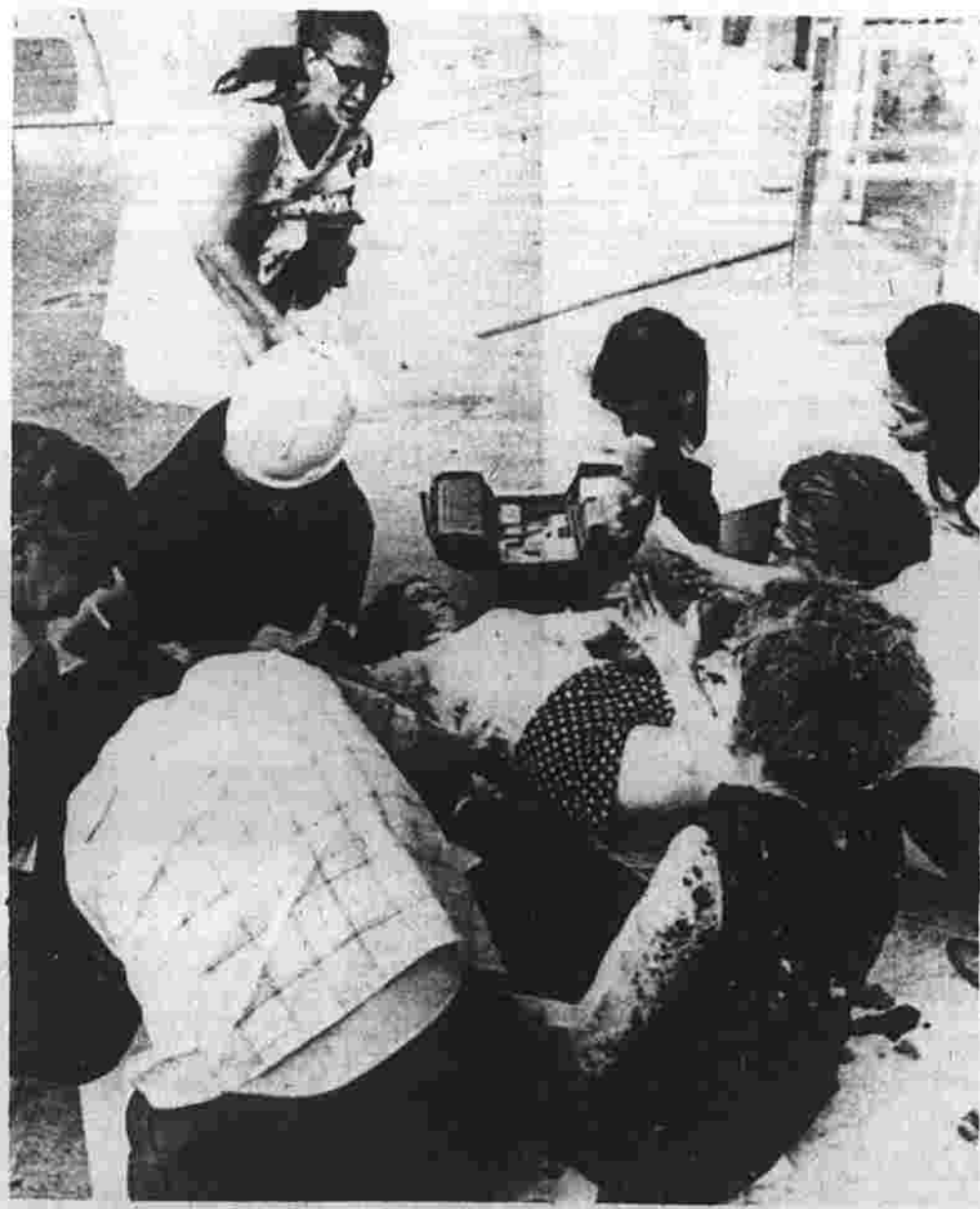
Blast victim in Columbus, Ohio, tries to reassure a friend that she will be all right. Twenty persons were injured in blasts in the city.