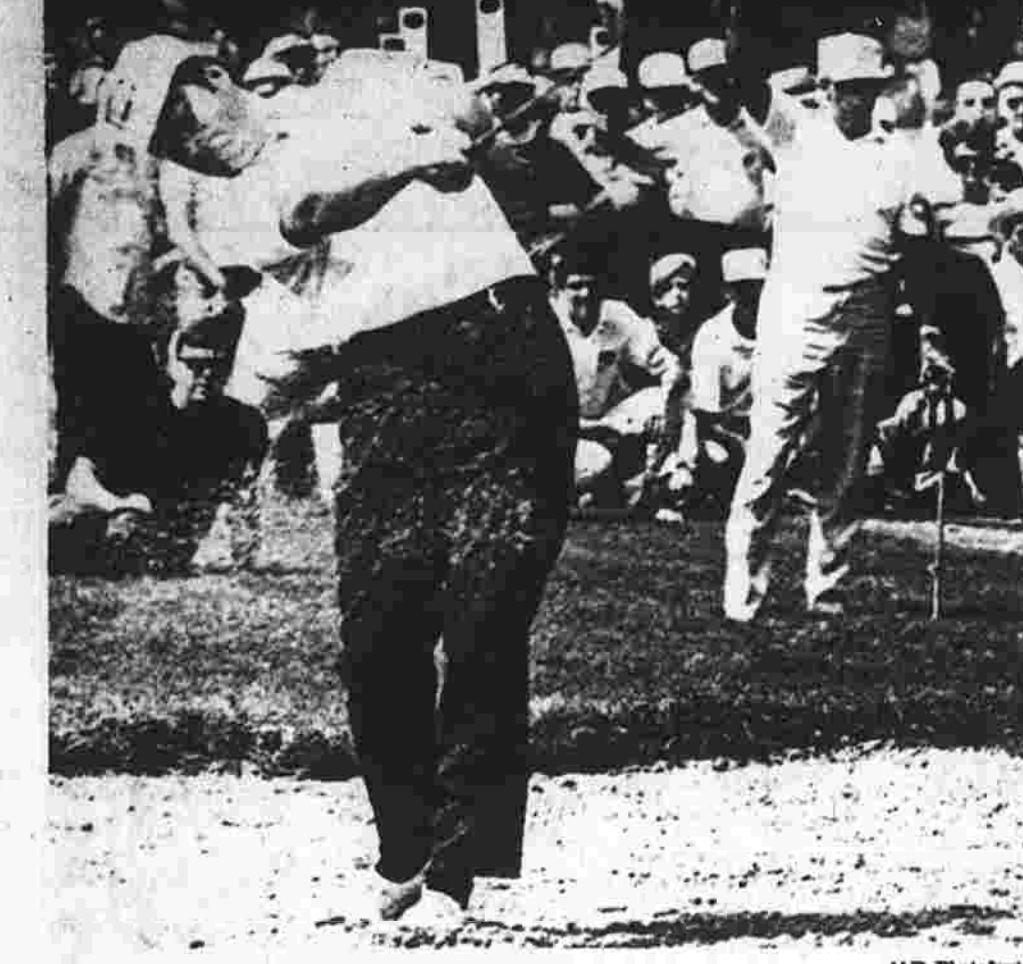
QUIET PLEASE!—Unruly crowd, cheering for Arnold Palmer to overtake Dave Stockton, had to be asked several times to be quiet when leader was lining up his putt. Here Stockton blasts out of sand trap en route to win.

LOS ANGELES AP — Eddie Meador, all-pro safetyman who announced his retirement from the Los Angeles Rams April 21, told team coach George Allen Sunday that he has decided to return to football. Meador had been with the Rams for 11 years. He was completely healthy when he was traded to the Rams last year. Meador told Allen by telephone from his Texas home.